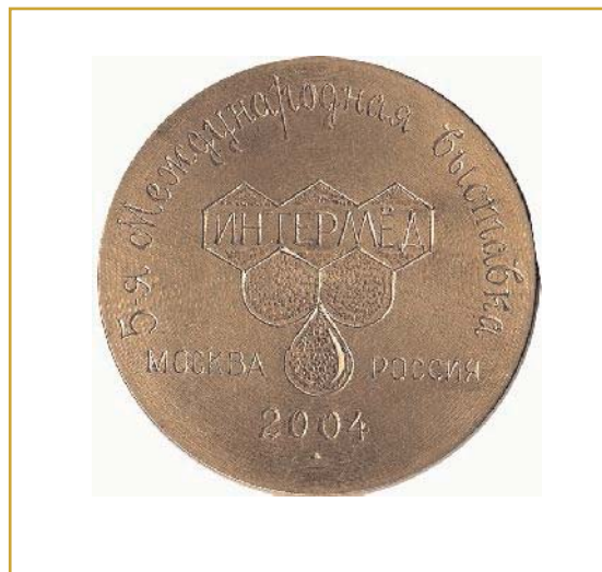
Russian Bee medal